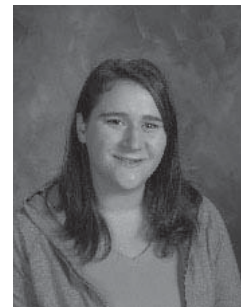
Bethany Torres Children's House