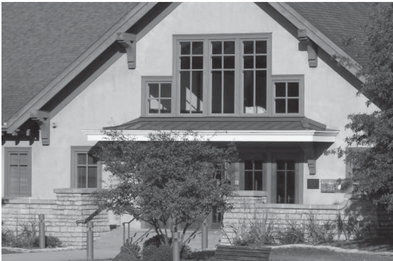
The Nature Center at Highbanks Metro Park was filled with interesting activities for our students.

Exploring nature is another way we teach the human potential.