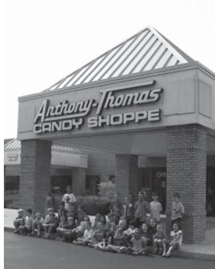
Primary 2 students enjoyed their delicious field trip to Anthony Thomas candy Shoppe.