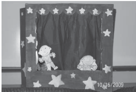
Spanish classes in the Primary level put on a puppet show for their guests.