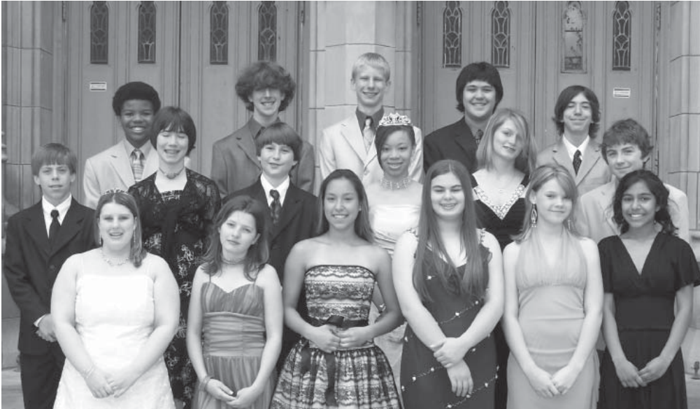
SJMS Class of 2006

Our friends from the Class of 2006 are moving on to college this year from four exciting years in high school. Here is a list of their future plans.